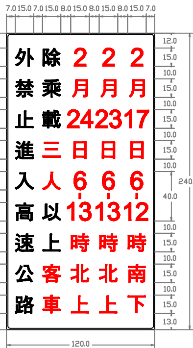
(B or R - B/W)