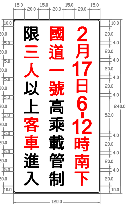
(B or R - B/W)