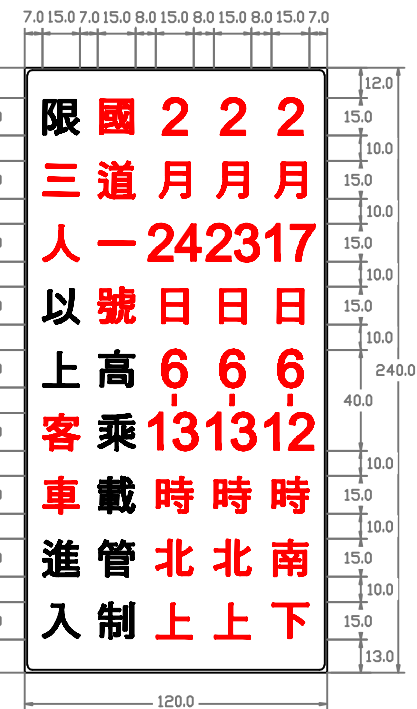
(B or R - B/W)