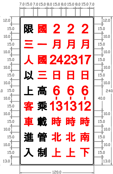
(W - W / R)