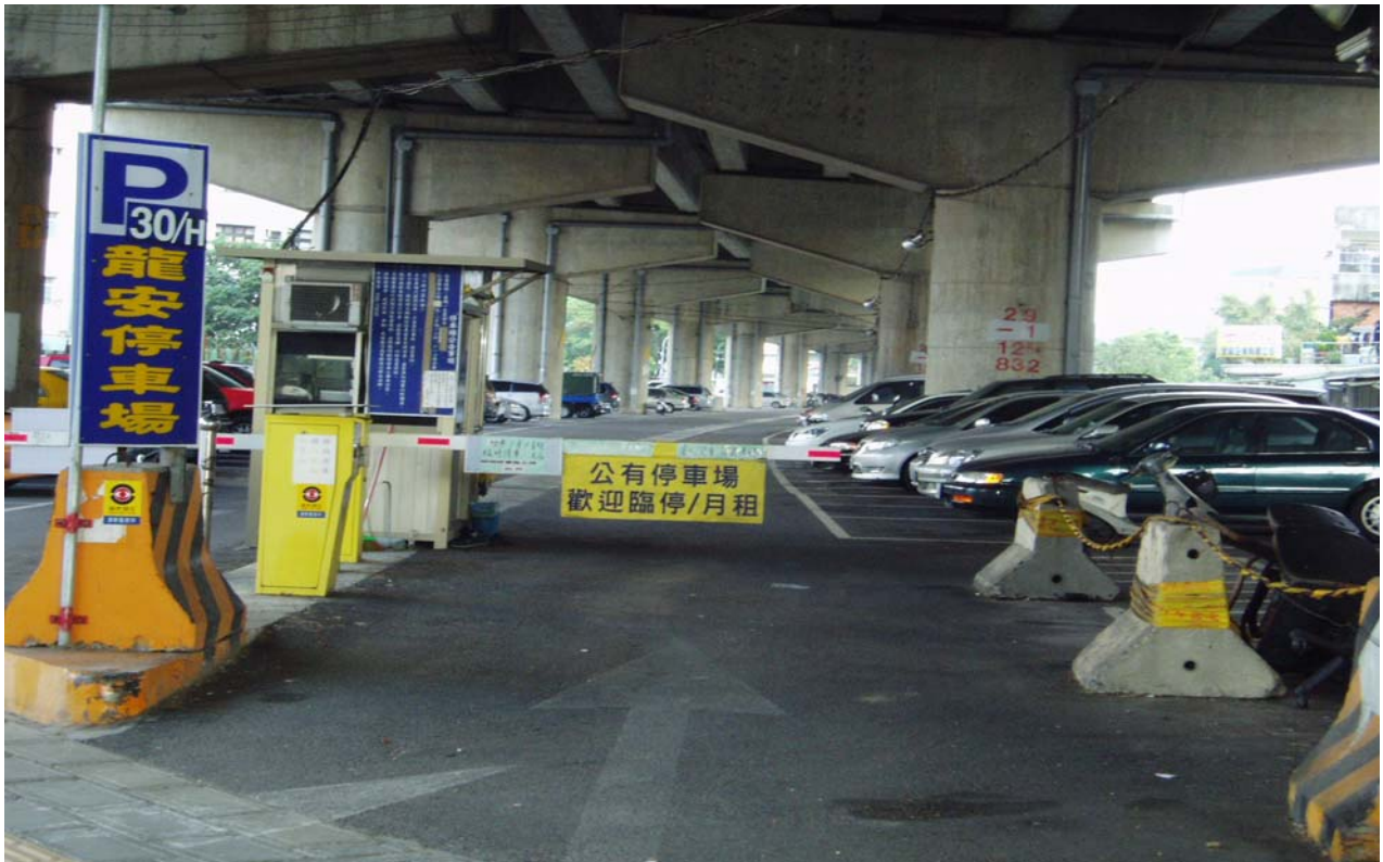
Parking lots (available for rent) under National Freeway No. 2 12k+162~12k+600 elevated bridge