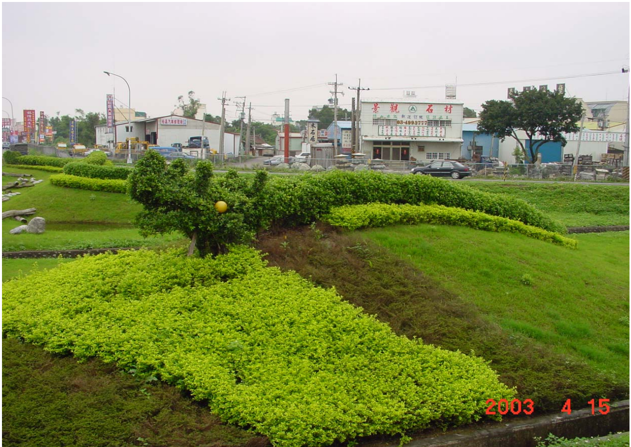
Longtan Township Office adopted National Freeway No. 3 Longtan Interchange

4)The national freeway interchange, road side slopes and under elevated bridge scenic garden adoptions are available for adoption to the public. Public and private organizations are encouraged to participate in the adoption of scenes alongside the national freeway. This not only improves freeway scenery, the incentive also increased public space and improve local living environmental standards. Currently there are 23 units adopting sites including Formosa Petrochemicals Corporation.