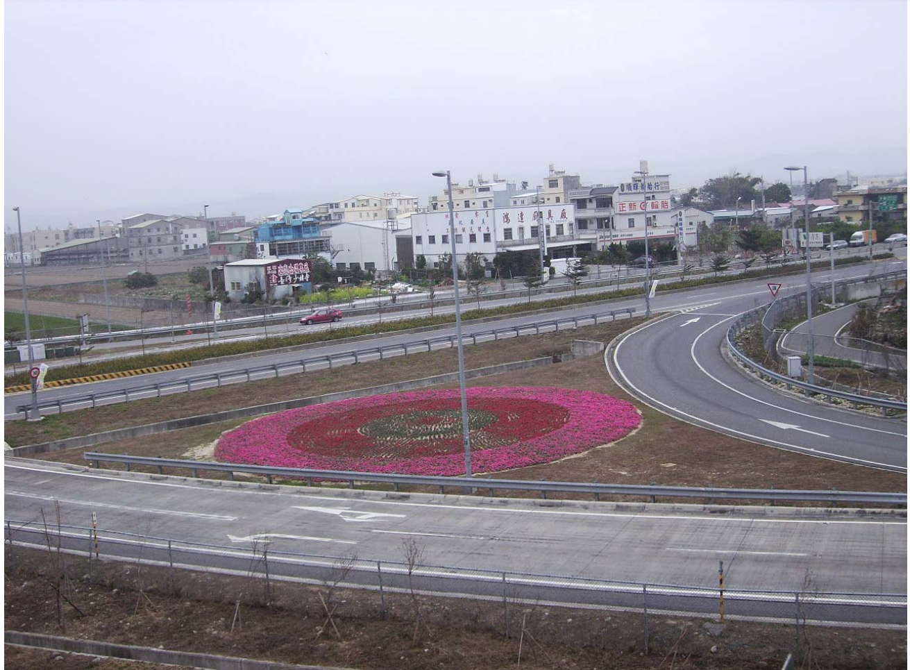
Miaoli County government adopted National Freeway No. 3 Yuanli Interchange channelization island.