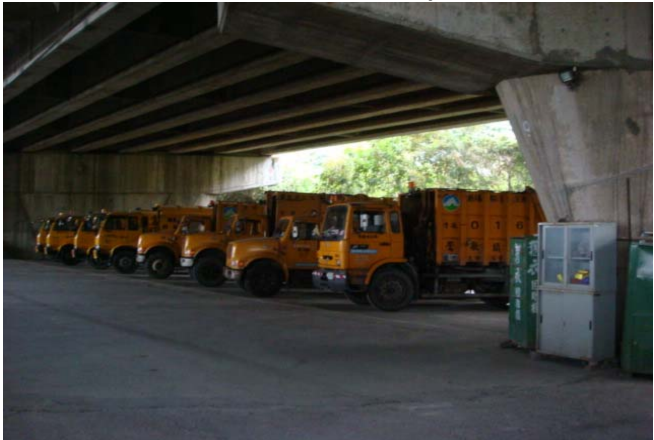
National Freeway No. 3 52k+200~240 garbage truck parking between the bridge piers.