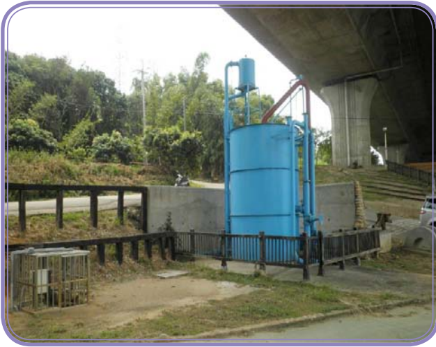
Taiwan Water Corporation, Fourth Branch rented the land under the viaduct at 180k+592~180k+603, National Freeway No. 3