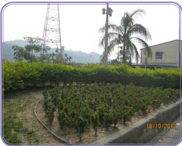
Mingjian Township Office adopted the land at 237k, Mingjian Interchange National Freeway No. 3 for greening use.