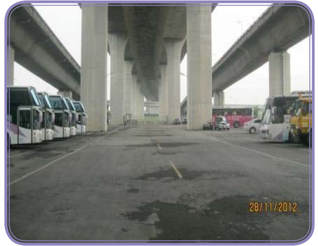
Kuo-Kuang Motor Transportation Co., Ltd. rented the land under the viaduct at 208k+541~208k+831, National Freeway No. 3