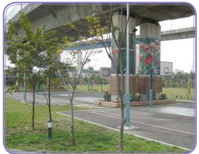
Changhua City Office adopted the land under the Changhua System Interchange viaduct (At the ramp "3" 0k +100 ~ 0k +400 and ramp "1" 0k +325 ~ 0k +638) for greening use.