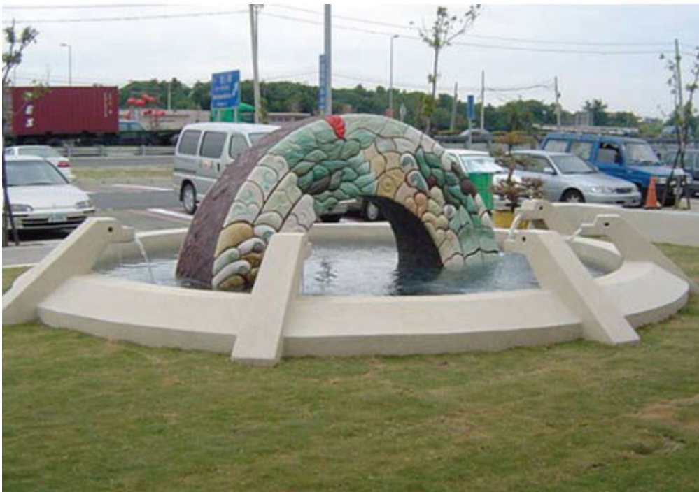
Rende Service Area