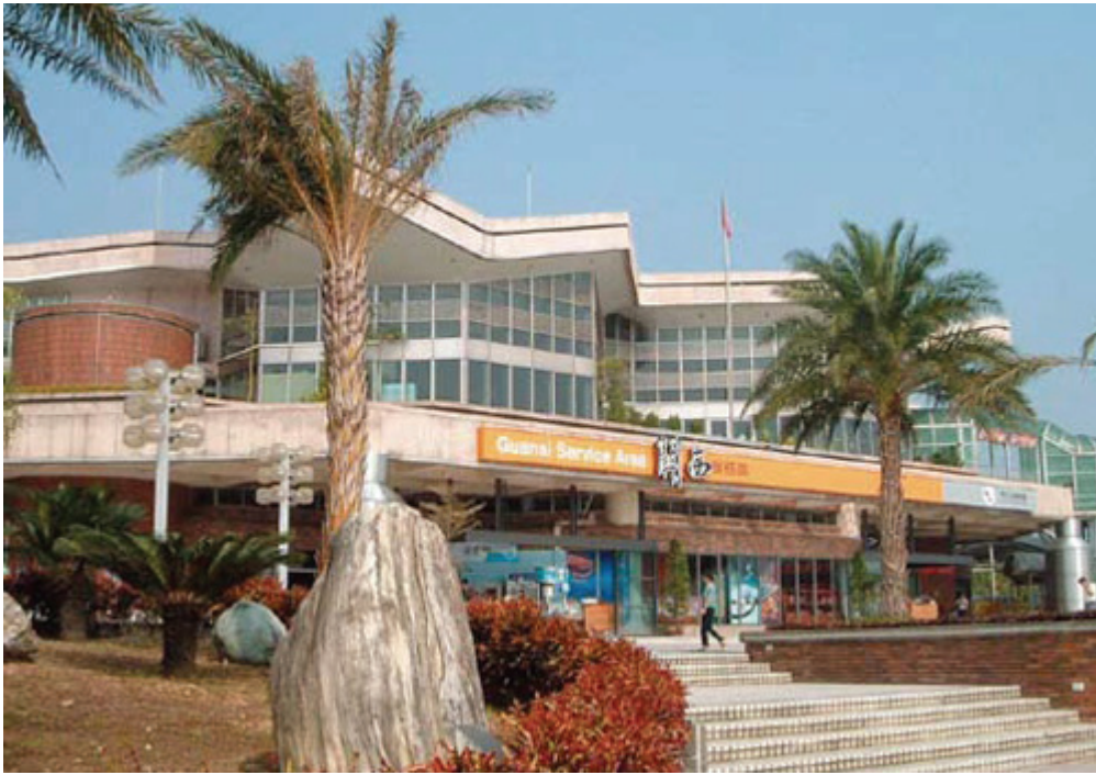
Guansi Service Area