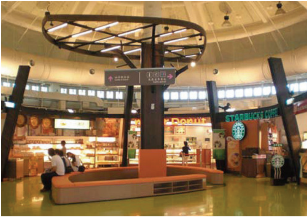
Dongshan Service Area