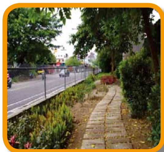
Yongfa Village Sanchong District, New Taipei City, 28k+540 ~ 28k+700 on National Freeway No. 1 to plant greenery and beautify current conditions