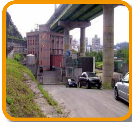
Water Resources Bureau, New Taipei City Government, leased 0k+753.5 ~0k+853.5 on National Freeway No. 3 Nankang access road to set up the Mingchuan Pumping Station

5. Open the landscape on the National Freeway interchanges, slopes and viaducts for adoption. Encourage public and private institutions, legal persons or unincorporated bodies to participate in the adoption of highway landscape maintenance work. This will not only improve the scenery along the National Freeways, but also help increase public space and enhance the living quality of neighboring communities. Currently, 57 organizations, including the Xihu Township Office, have applied for adoption.