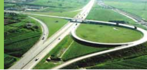
December 2011 Freeway Right of Way Land Area Table