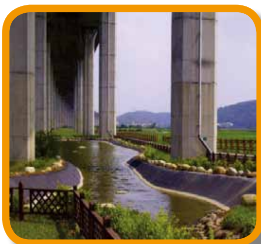
Xihu Township Office, 136k+100 ~ 138k+200 on National Freeway No. 3 to set up a bicycle lane under the viaduct, plant greenery and open an activity area

5. Open the landscape on the National Freeway interchanges, slopes and viaducts for adoption. Encourage public and private institutions, legal persons or unincorporated bodies to participate in the adoption of highway landscape maintenance work. This will not only improve the scenery along the National Freeways, but also help increase public space and enhance the living quality of neighboring communities. Currently, 57 organizations, including the Xihu Township Office, have applied for adoption.