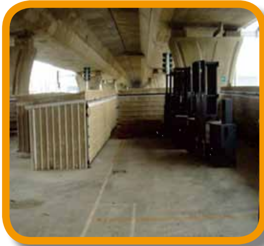
Singular Machinery Co., Ltd, leased 13k+765 ~ 13k+831 on National Freeway No. 4 to set up a parking lot and storage facility